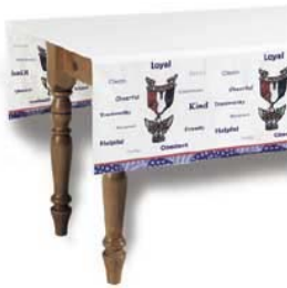
table cloth (1)