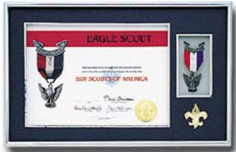
Eagle Certificate and Medal display