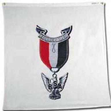
Troop banner- for display and signature of Eagle scout on back

Troop will display an Eagle banner (having each Eagle Scout add his signature to the back), and one tabletop center piece.