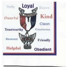
2-ply napkins (100/2pkg)