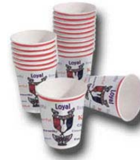
9oz cups (50/1pkg)

Troop will display an Eagle banner (having each Eagle Scout add his signature to the back), and one tabletop center piece.