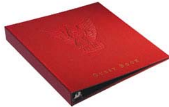
Guest book (1)